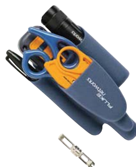
ProTool Kit IS60