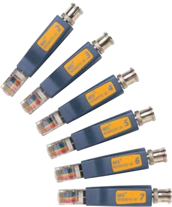
Remote Identifier Kit