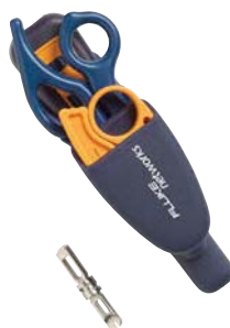
ProTool Kit IS50