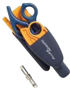
ProTool Kit IS40