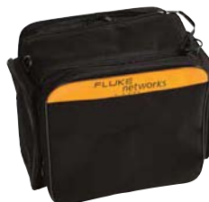
Batteries, Chargers and Cases