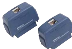
Patch Cord Test Adaptors