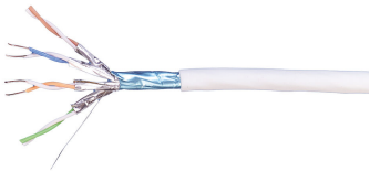
CS44ZC Category 6A F/FTP Cable, low smoke zero halogen, white jacket, 4 pair count, 1640 ft (500 m) length, reel