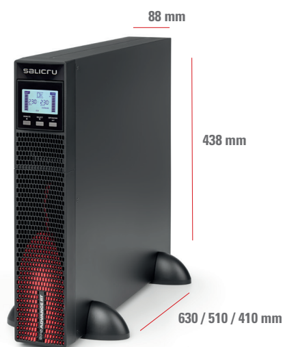
SPS 800-3000 ADV RT2